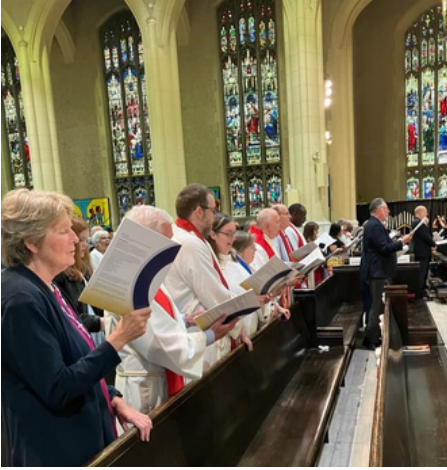
Beautiful Stain Glass Windows!