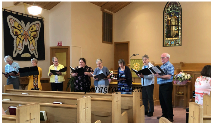
Our wonderful choir