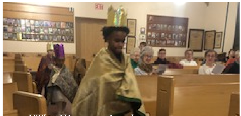
Our Angels and Kings arrive at the Stable